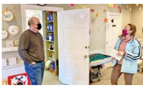
I recently had the privilege of visiting the Center for Loss and Bereavement and learned more about the important work they do to support those experiencing grief and those struggling with mental health challenges.