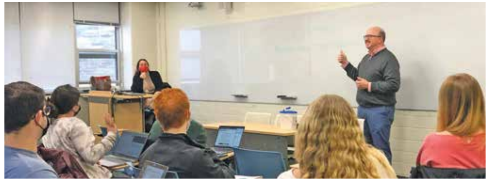
It is always exciting to return to my alma mater Villanova University and speak about career opportunities in public service! I enjoyed chatting with students in a Public Policy Paths class during the spring semester.