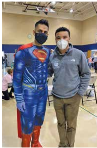
Skippack Pharmacy held a successful vaccine clinic for kids in December!

A comprehensive list of COVID-19 vaccine providers is available at www.vaccines.gov or by calling 1-800-232-0233.