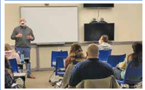
I had a nice time chatting with Montgomery County Community College political science students as part of the college's "Legislator in Residence" program. The students had great questions, and we touched on a lot of important issues like education funding, health care and business growth.